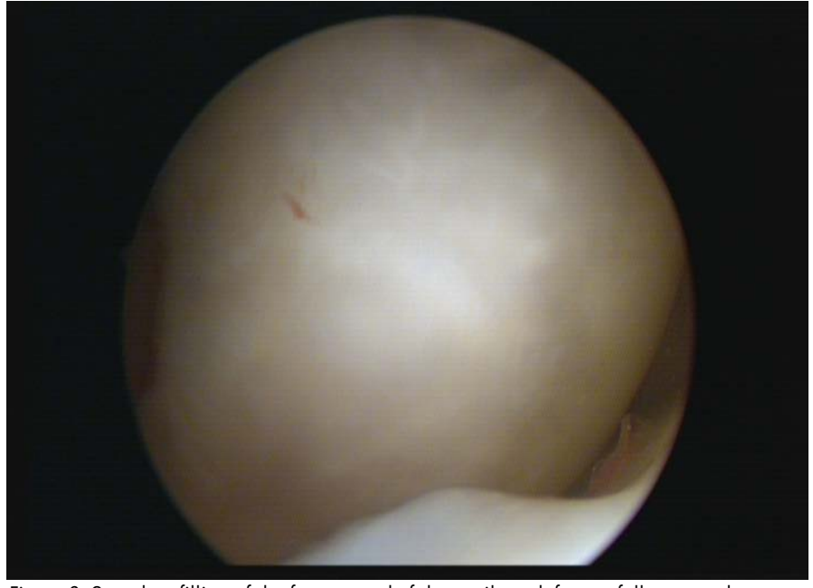
Figure 3. Complete filling of the fracture and of the cartilage defect on follow-up arthroscopy.